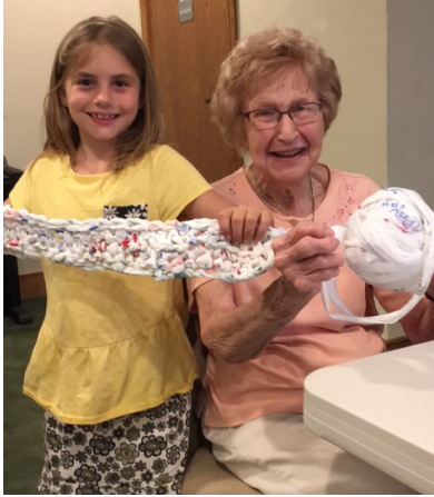
People of all ages work together to make sleeping mats.

The making of the mats out of used plastic shopping bags, is not hard, but does require investment of time and busy hands. The bags are prepared by cutting strips and joining the strips and rolling them into balls called "PLARN" (PLastic yARN). The Plarn is then crocheted or woven into mats.